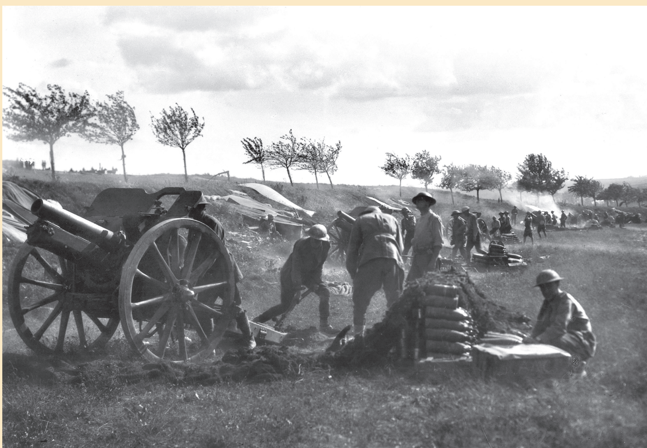
108th Howitzer Battery in action. AWM E03114