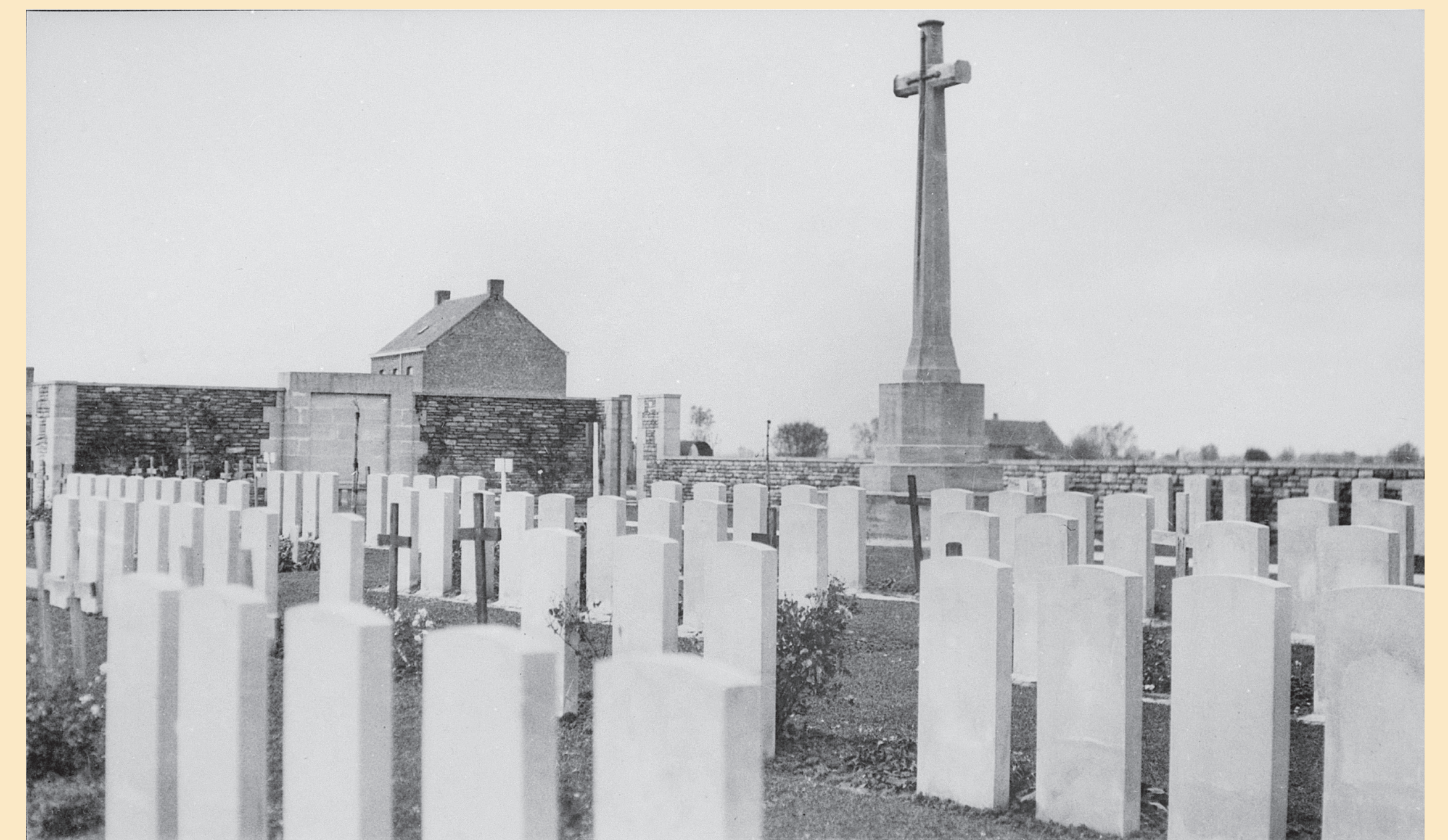
The Strand Military Cemetery. AWM H12650