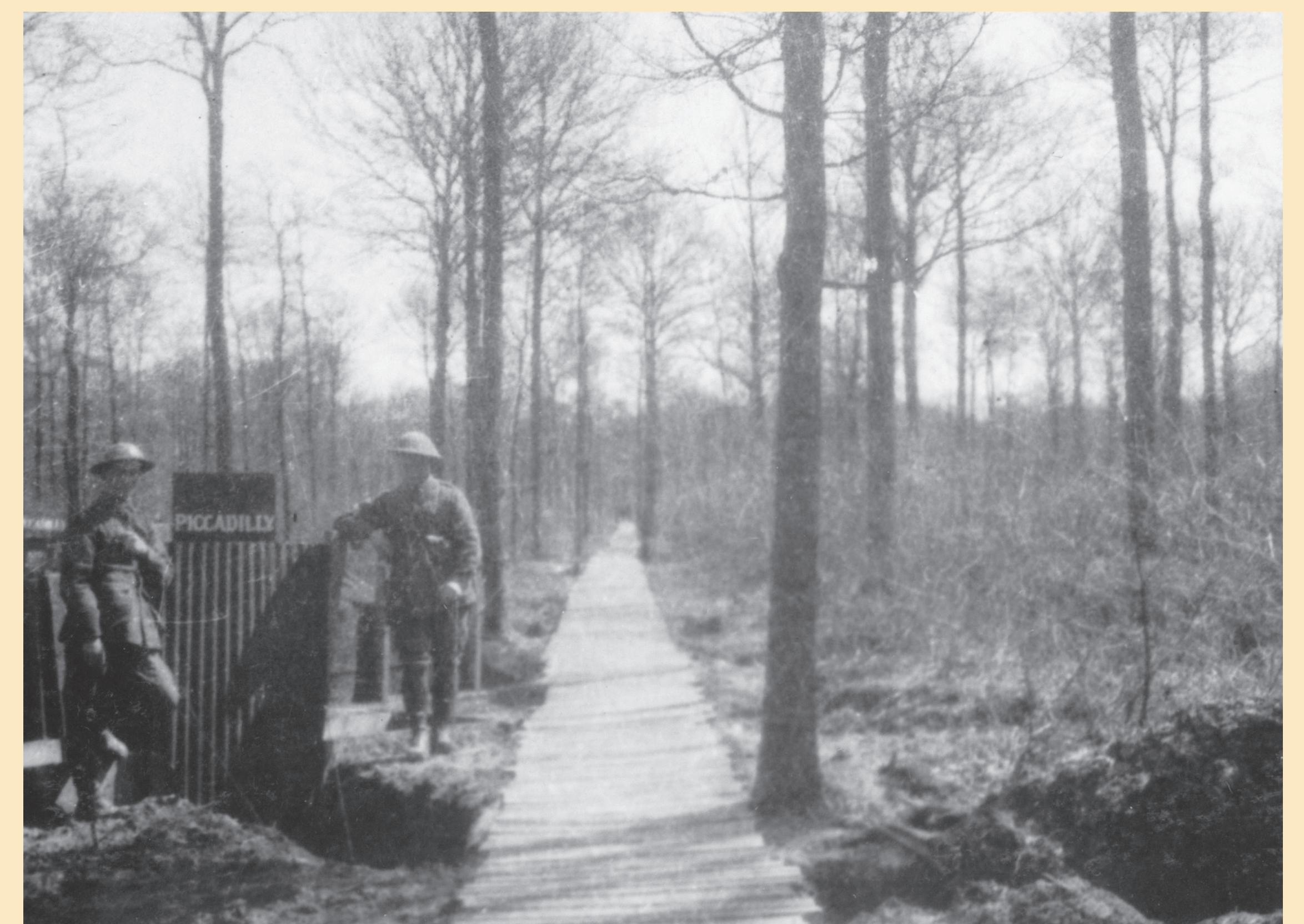
Two soldiers beside a sign reading 'Piccadilly' on a track in Ploegsteert Wood. AWM H02093