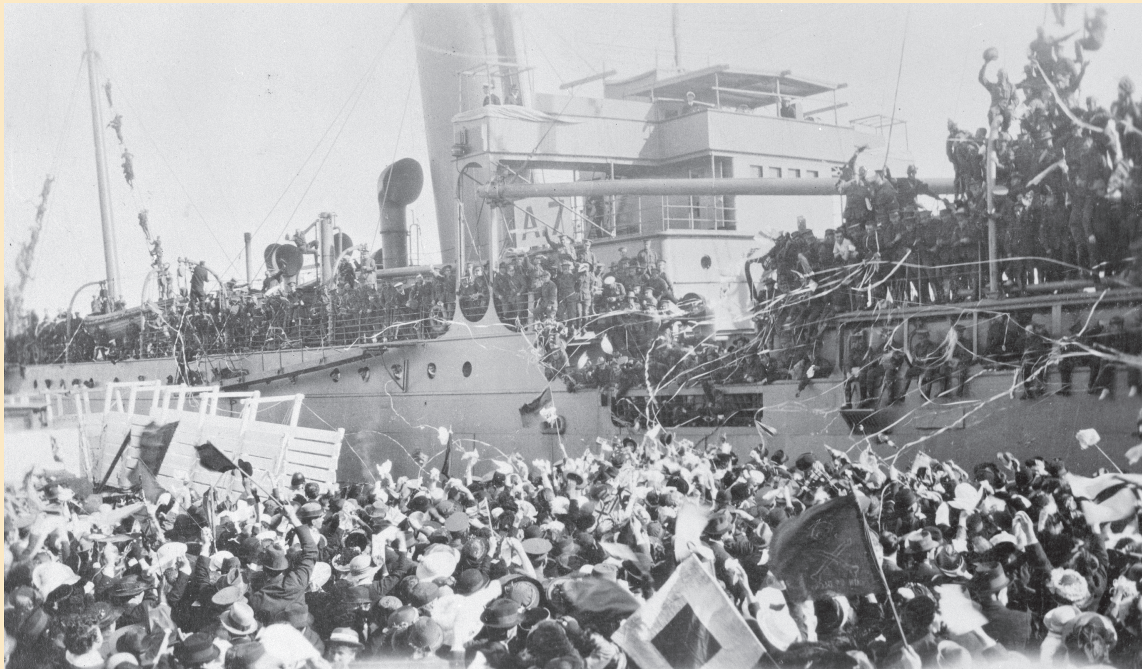
Medic leaving Port Melbourne.

Torpey's sister Josephine received a war pension of £2 ($4) a fortnight following his death.