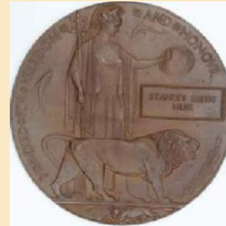
Dead Man’s Penny