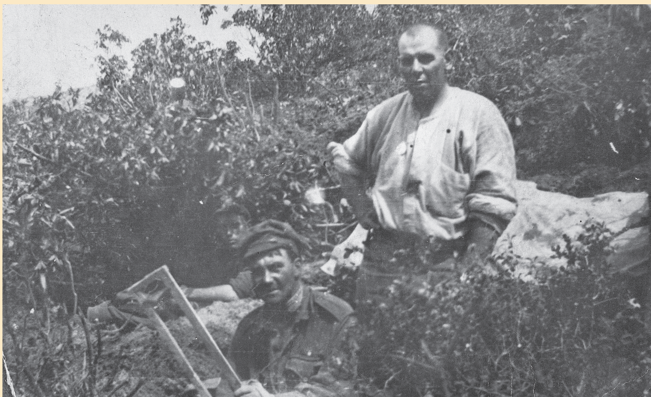
Members of A Company, 4LH, without their horses, supported the infantry by digging holes for the Turks to fall into, Gallipoli, c.May-June 1915.