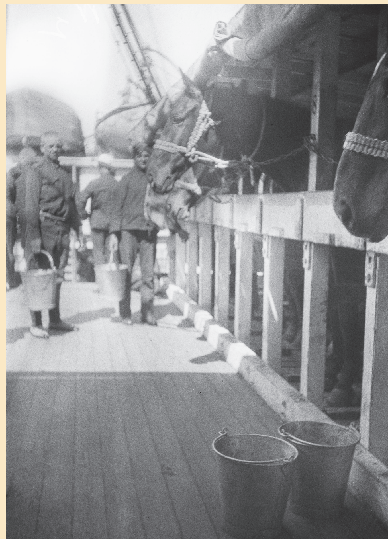
Members of 4LH feed their horses aboard HMAT Wiltshire, October 1914.