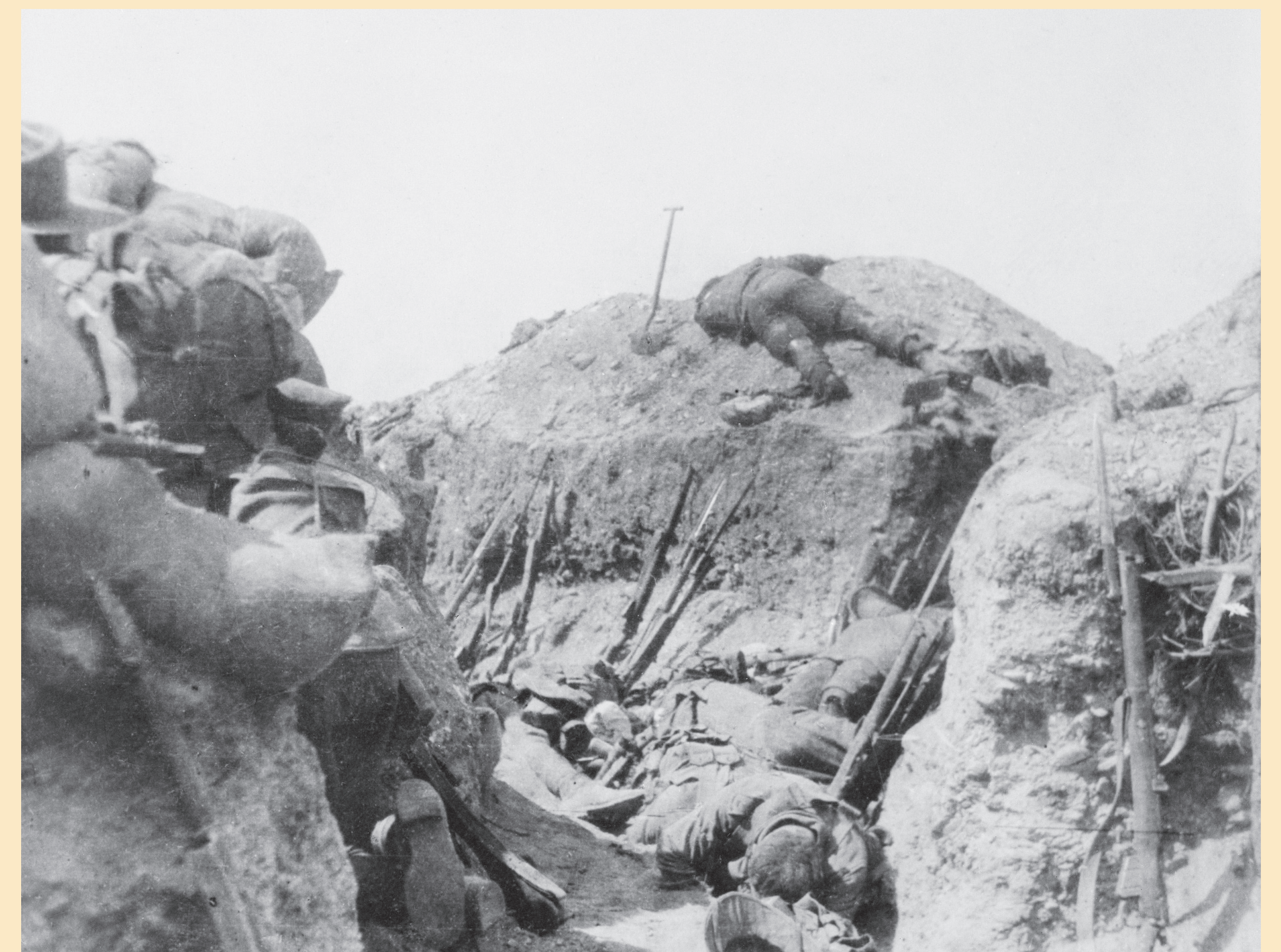
Bodies of Australian Soldiers at Lone Pine, 8 August 1915. AWM A04029