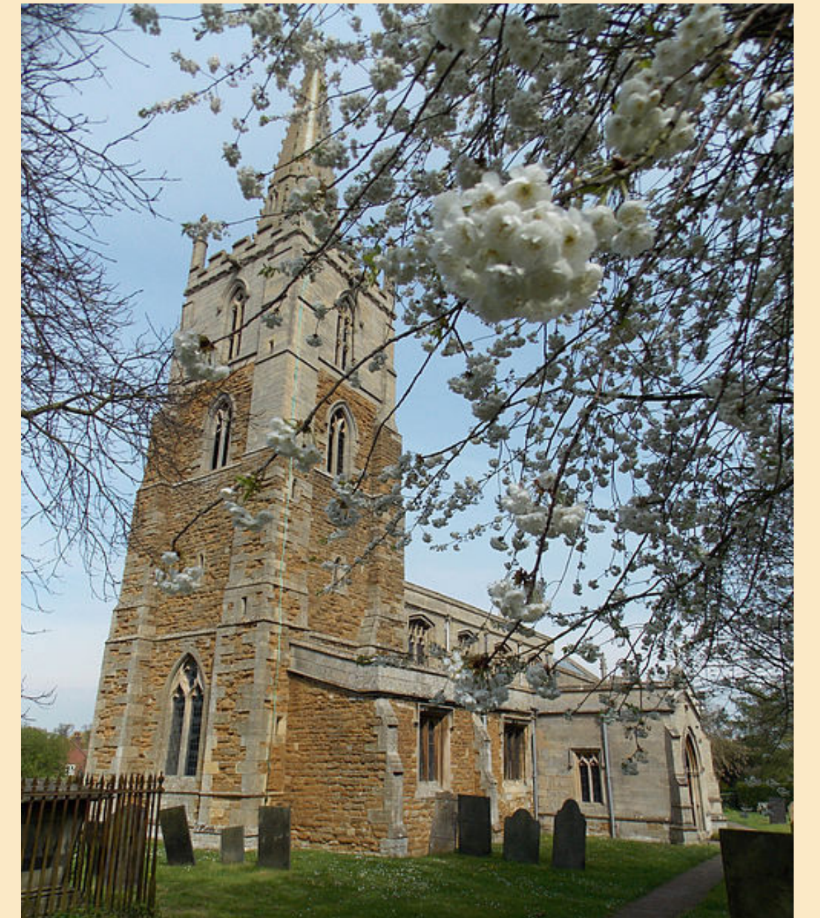
Church of Sts Mary and Peter, Harlaxton, UK