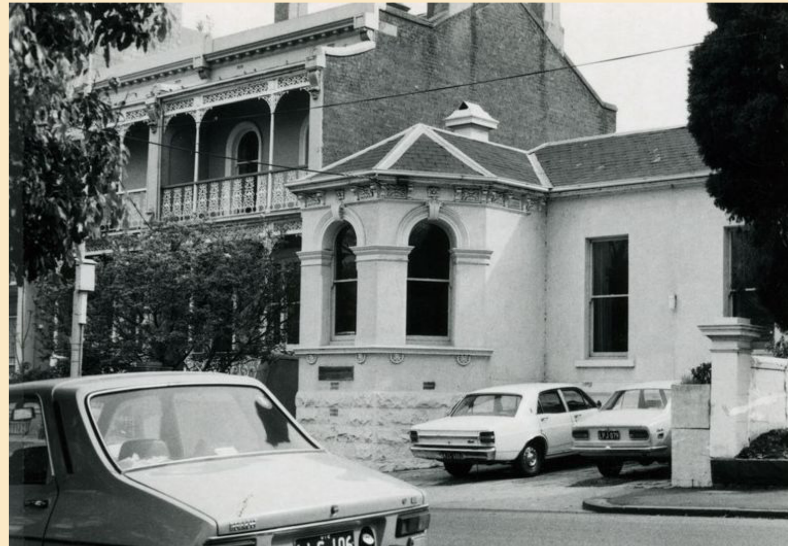
60 Jolimont Street, Jolimont.

Commemorative Dead Man’s Penny with a letter signed by the King sent to his grieving family.