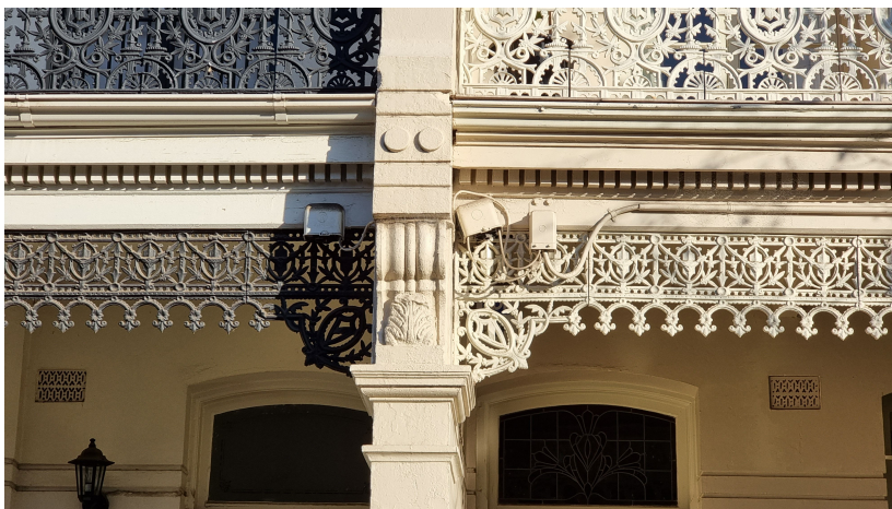
Mannerist detail, reversed acanthus leaf.

first floor. Typically, this spot might bear a scroll with an acanthus leaf below, pointing downwards, here, however, it is as if the leaf has been turned upwards and it sits within the curve of the scroll. A small but significant rebellion. There are other details, too, but perhaps it would be tedious to list them all. For those interested I recommend Jennifer Fowler's thesis which can be found at http://hdl.handle.net/11343/241383