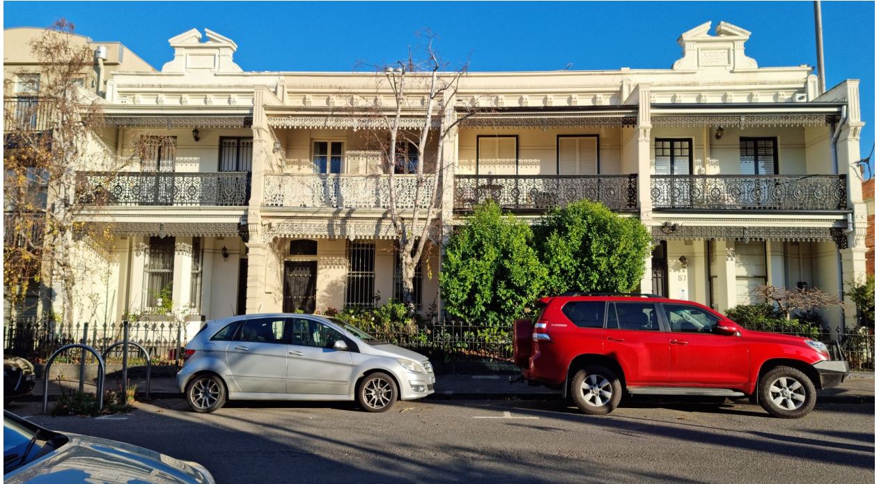
51-57 Berry Street.

the middle of the building, or perhaps a pediment over each individual house, but here the architects have placed a broken pediment over the two end houses with the two middle houses left unadorned. The terrace retains its symmetry but changes the rules. Another subversive detail appears on the face of the dividing walls, where the ground floor meets the