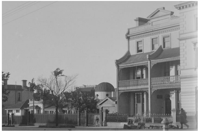
166-168 Ladies' College, Clarendon Street, the two terrace houses to the right of the picture - photo c1925