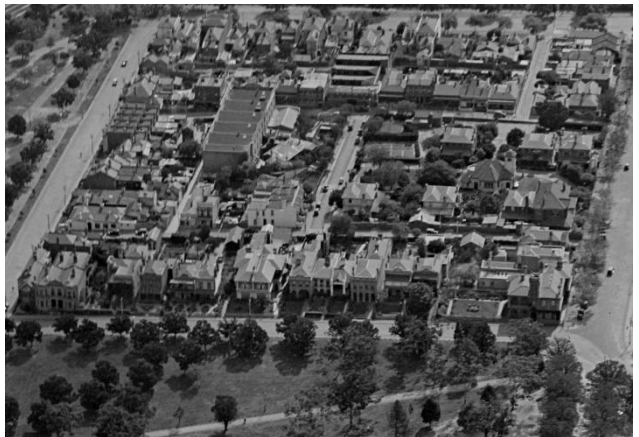
Fenton's warehouse, at this time Bedggood's, stands out in this 1931 aerial photo of Jolimont taken from above Yarra Park looking West

It was to be built immediately to the south of Jolimont House, on a remaining portion of the old