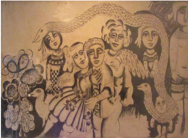
Mirka Mora mural uncovered by Tippler & Co proprietor, Gus McAlister when restoring the old Balzac restaurant

The new restaurant licence introduced in 1960 allowed alcohol to be served with food. Balzac was the first restaurant to obtain this licence in Victoria, and it allowed alcohol to be served with meals until 10 p.m.