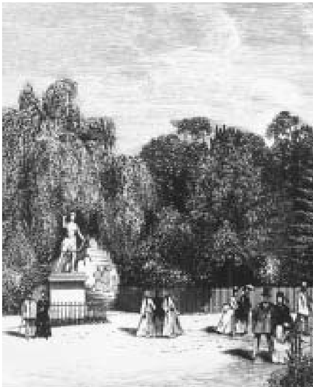
Photograph of Fitzroy Gardens, looking west. Rudd's New Views of Melbourne